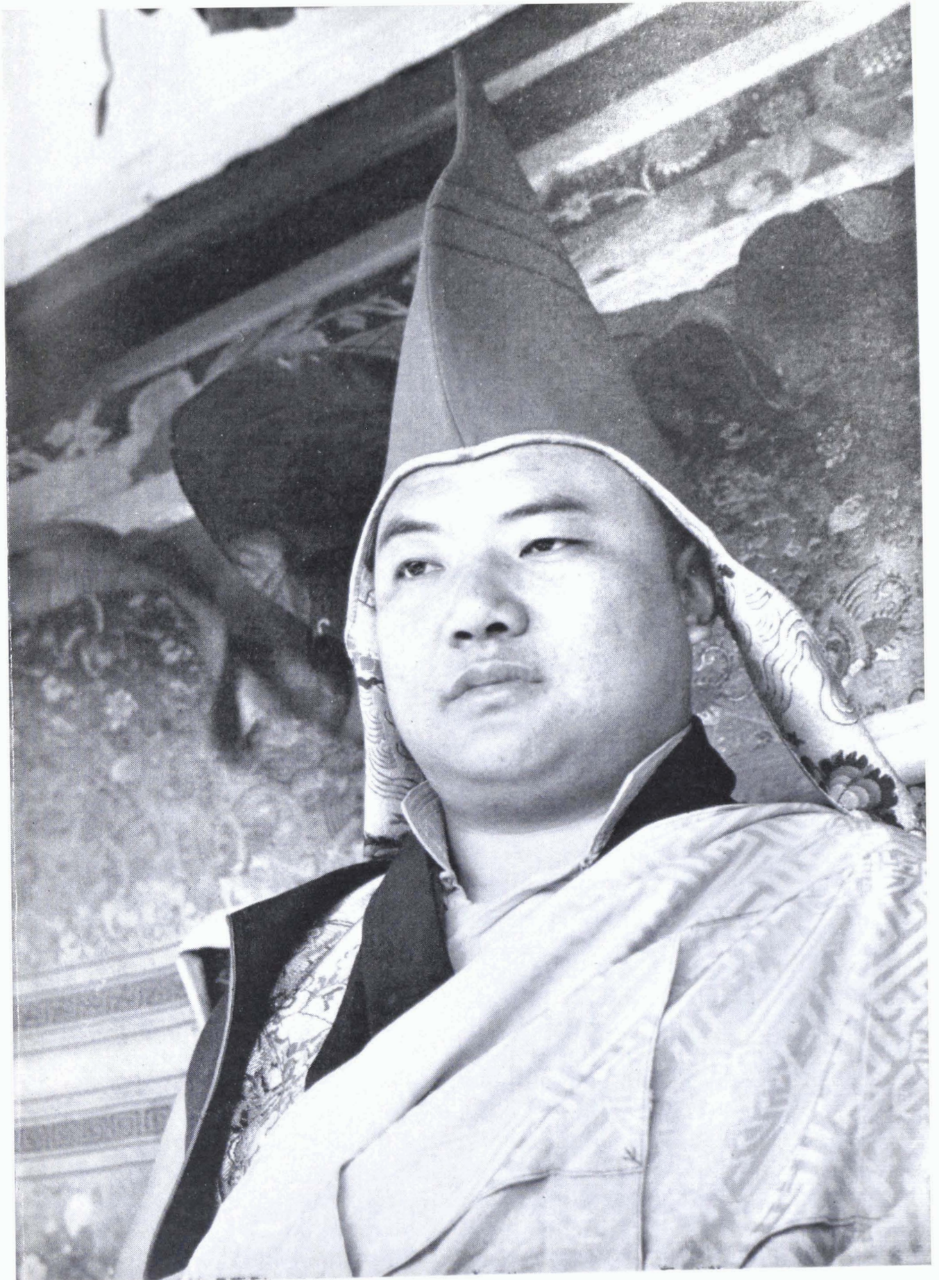
Gyalwa Karmapa (Rumtek, Sikkim)