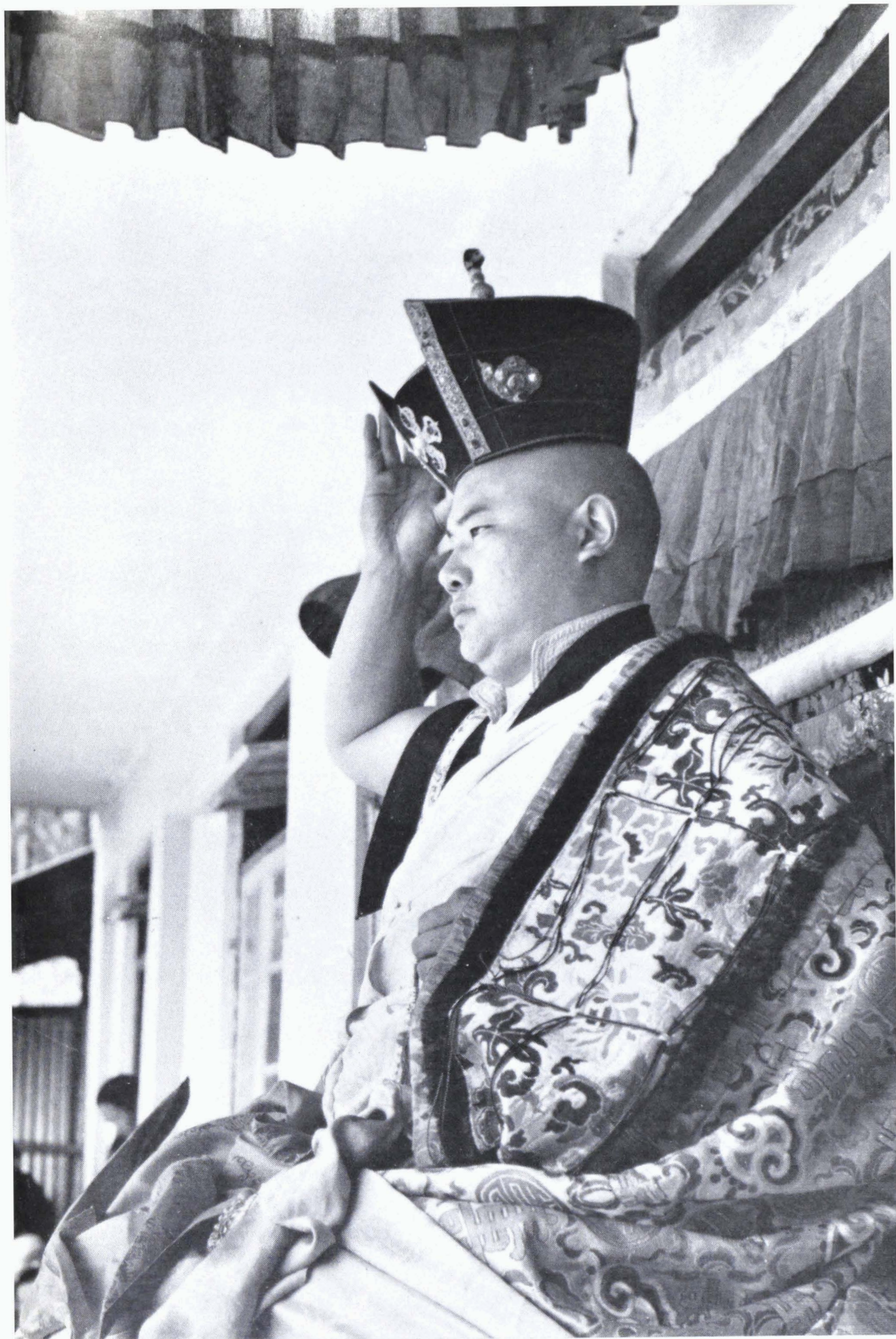
Gyalwa Karmapa (Hat wearing ceremony)